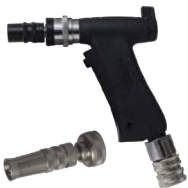
WYS-228 Sanitizer Pro Conversion Kit