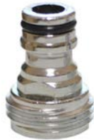
WYS-105 Male Quick Connector