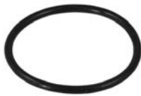
WYS-115 Hydro Seal