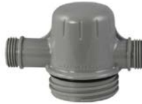
WYS-108 Hydro Body