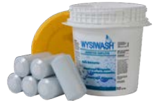
WYS-117 Wysiwash Jacketed Caplets 9-Pack